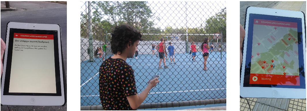
Figure 3. Walking in the hybrid space of Soundscapes/Landscapes

In the brief discussion that follows about the conditions of developing pathways of experience through S/L , I focus on some textual directives it provides to users, as guidance for moving and for relating mediatized content with the surrounding physical space. As users move in space, short texts variations such as the following appear occasionally on their screen: 'There is no correct path. If you do not know which way to go, simply improvise. There is no way you can get lost' ; 'You don't have to follow a certain direction. So don't get stressed over experiencing S/L correctly. Around every point, near or far, there are other points. Go back, move forward, cross streets, squares, parks, roads' ; 'You don't have to look at your tablet and your map all the time. Let yourself be swept by emerging soundscapes' .