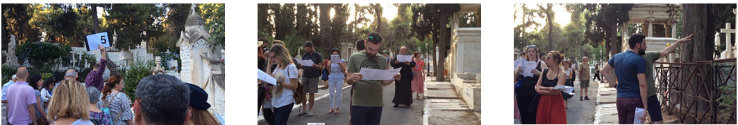
Figure 2. Stopping at Breath

the guide raises his hand holding a printed sign of the stop number. Walkers open their leaflet to identify their location on the map and to read the two short texts related to the particular stop. Unlike traditional guided tours, the texts are not intended to provide information conforming to an official narrative about the monuments at the stop (e.g. notes about the renowned deceased or the sculptor of the tomb), but rather to create a conceptual framework for the collective experience. The function of the first text is to provide a sensory description that proposes ways of listening to the location: how and what walkers may listen. The second text offers excerpts from literature that can be linked associatively to the ongoing spatial experience. Prompted thus to identify the location, to direct their senses and to develop associations, walkers now raise their head from the leaflet and develop their in situ sensorial-associative relation to the surroundings. At the same time, artificial sounds are occasionally produced by performers who move around the group of walkers. According to Kamarotos, the aim of these sounds is to awaken the senses, particularly hearing. After a while, walkers hear a discrete bell ring marking the end of the stop and they resume their walking.