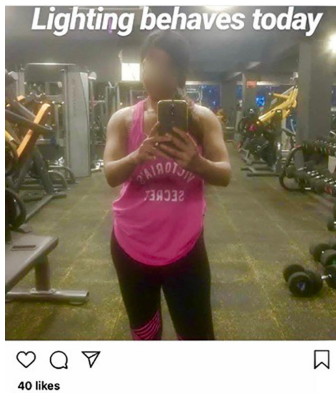
Figure 1: Participant 6

the image. The image, frozen in time, is not simply a narrative of the time in question but also of the sensory-motor dedication and consistency in workouts that have brought the 'fit' body into being with time. The existence of the selfie, itself, is dependent on the efficiency of the fitness performance prior to and immediately before the performative act of clicking the selfie.