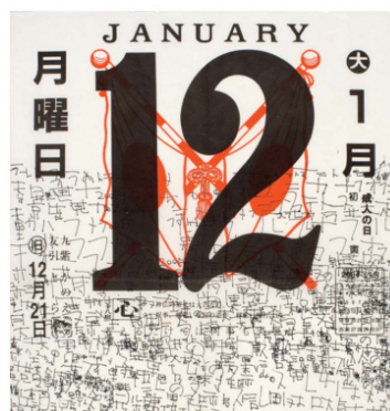
Fig. 2. Kunizo Matsumoto, untitled (1554) © ART BRUT – collection abcd, Montreuil.

From a topological perspective there is no doubt that the texts in question aim to saturate the writing surface, where full spaces prevail over empty spaces to an overwhelming extent, to signify a sort of irreversible branding of the support by the artist. Nevertheless one notices, in certain series, the expression of a kind of iconic “respect” towards the semiotized area. In the case of the calendars presenting decorative frills (see fig. 1), for example, these frills are never marked by the glyphs but are accurately avoided instead, as if to honour the intrinsic harmony of the support. On the contrary, as far as concerns the calendars without images (fig. 2) but showing the dates in cubital characters, the artist invades the space already occupied, writing over them, but interrupting his calligraphic outburst when he comes to the more visible paratextual ideograms situated at the top; nevertheless it should be highlighted that this occurs only in certain series of works, while in others the page is regarded as a “signable” surface in its entirety, as in fig. 3, where the only differences to be found in the support are the absence of the red design behind the central number and the utilization of a blue font. The page is therefore treated with a certain semiotic reverence out of respect for the signs which, in order of size but also of meaningfulness, already inhabit